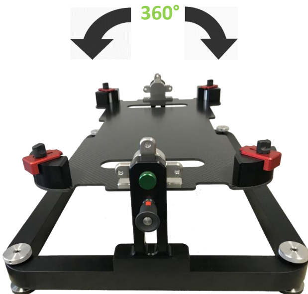
Fig.1: Rotating Holder at 0° position