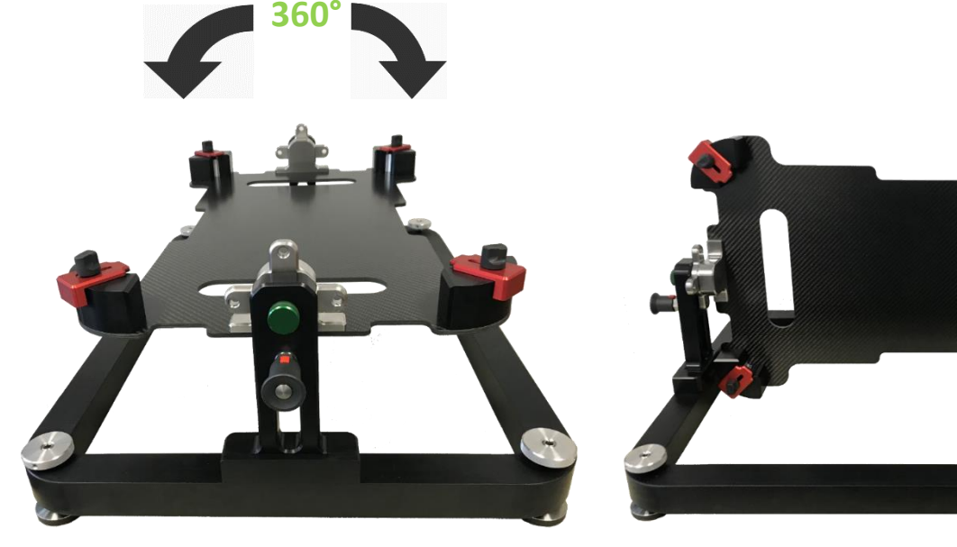
Fig.1: Rotating Holder at 0° position