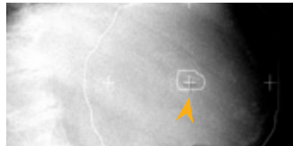
Liver: 1 VISICOIL 0.35mm x 1cm